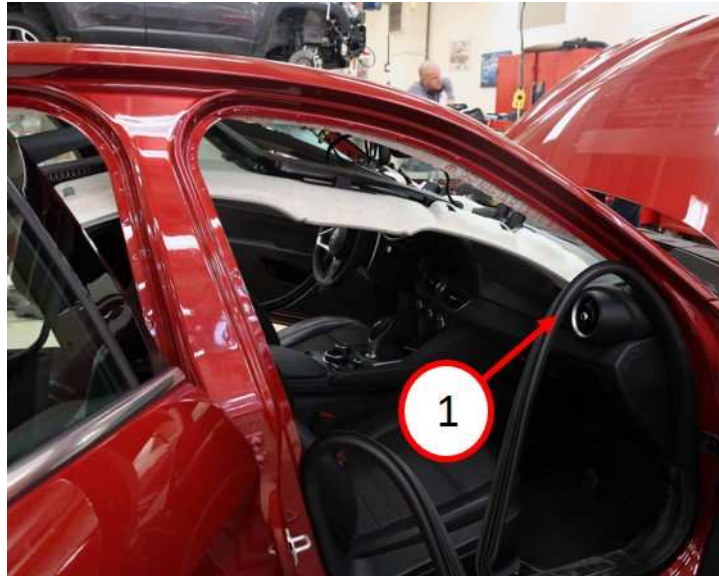
Fig. 5 Right Front Door Seal