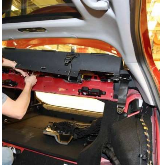
Fig. 4 Rear Shelf Panel