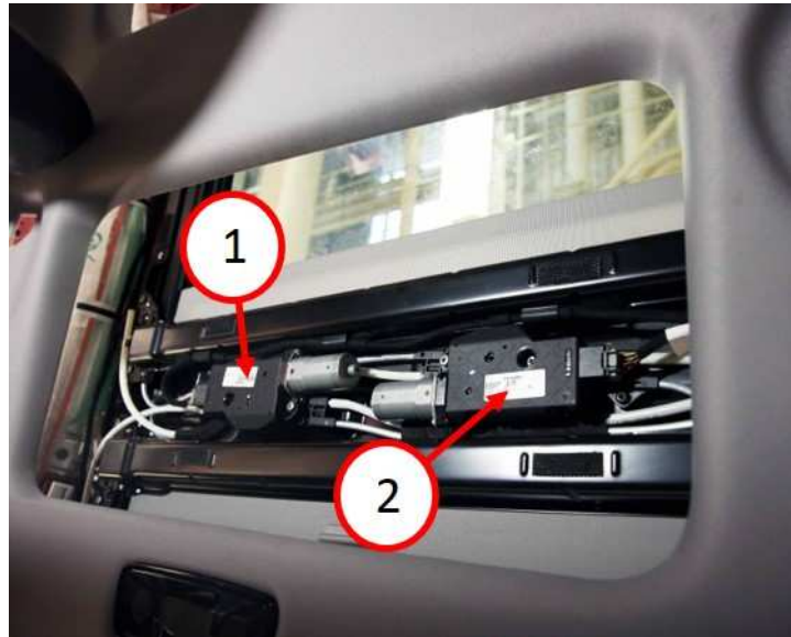
Fig. 7 Sunroof and Sunshade Motors