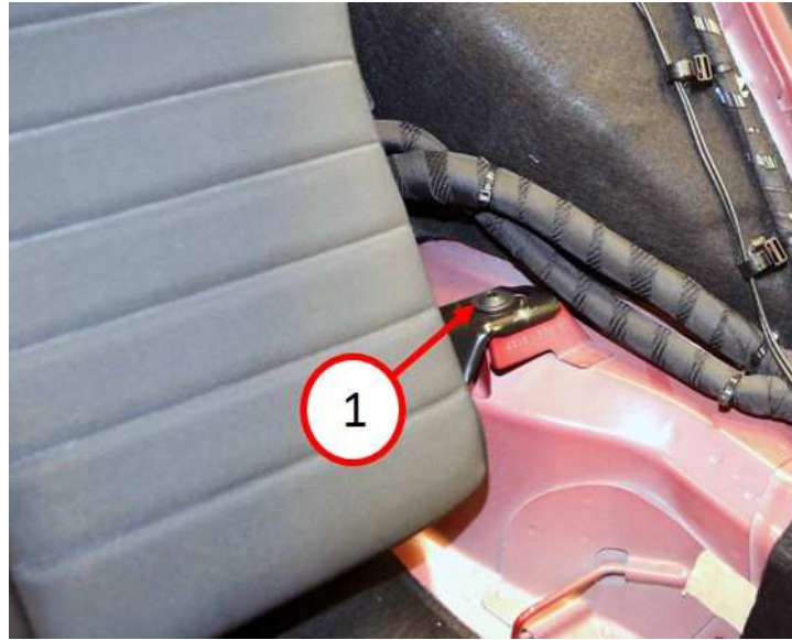
Fig. 2 Rear Seatback Bolt Location