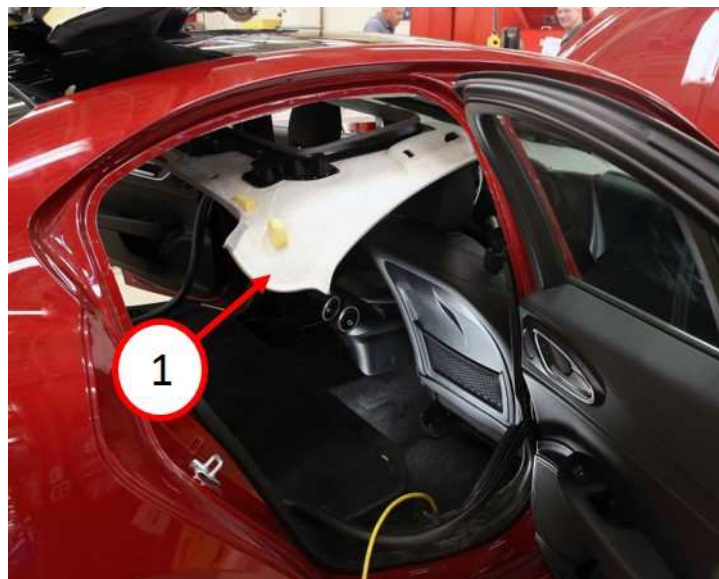
Fig. 6 Headliner Lowered