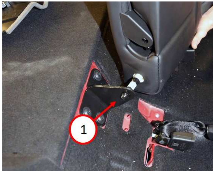
Fig. 3 Center Pivot Bracket